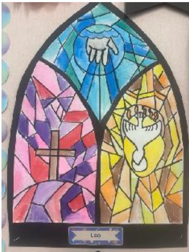
Some fabulous artwork from St Augustine Class