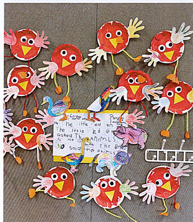
St Mary students Artwork - The little Red Hen