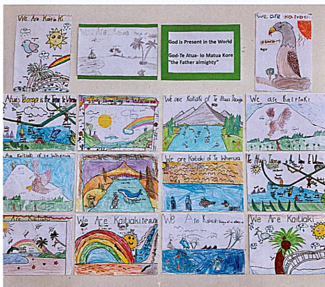
St Peter Kaitiaki Art

Huruhuru Team: Monday 13 November 9am - 12pm Mohehu Team: Tuesday 28 November 9am - 12pm Matikao Team: Thursday 30 th November 9am - 12pm Parents are welcome to come along to support your children