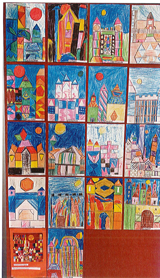
St Francis Artwork