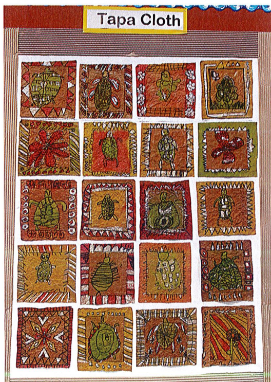
St Nicholas Artwork

The Catholic Diocese of Auckland is seeking a methodical, cheerful, dedicated, and highly efficient person for the role of PSG Administrator & Communications Officer to provide administration and operational support to the Leader Pastoral Services Group and providing communications support for the Diocese. This is a part-time role of 25 hours per week with flexibility of hours between 9.am and 3.pm. Excellent interpersonal, verbal and written communication skills, along with proficient IT competency in Word, Excel, Free Source Design e.g. Canva and knowledge of websites (WordPress), social media, Facebook. Can work under own initiative be creative and have a can-do approach to work and is efficient, accurate and organised. For more details, and a full position description, please visit the Diocesan website https://www.aucklandcatholic.org.nz/staff-vacancies/ Applications close on 18 August 2023.