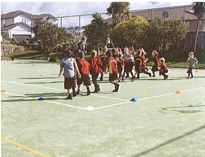
St Benedict Class enjoying their session with Kelly Sports