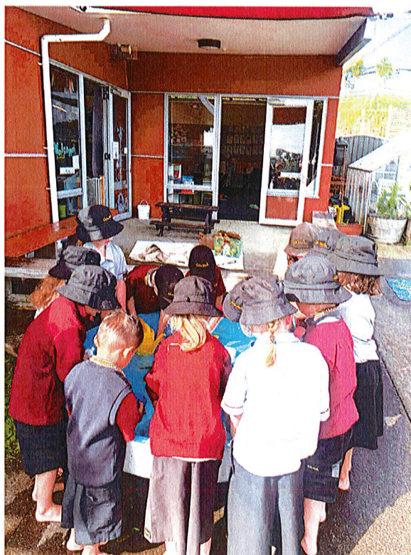
St Mary enjoying some play based learning