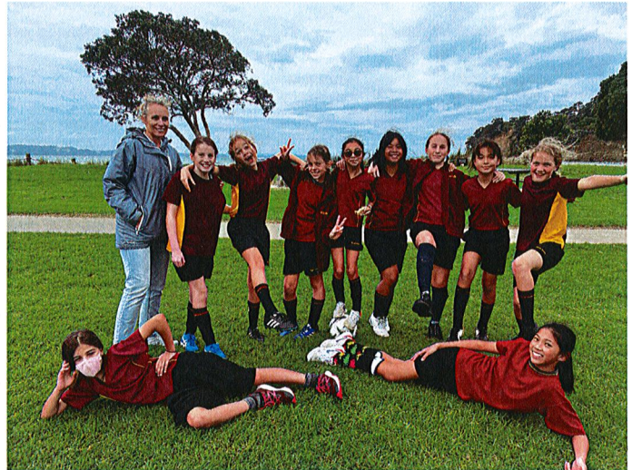
Year 5/6 Girls Interschool Football Team