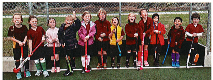
Year 1 and 2 Hockey Team