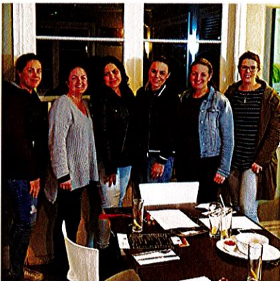
Some of the team at our last PTFA meeting